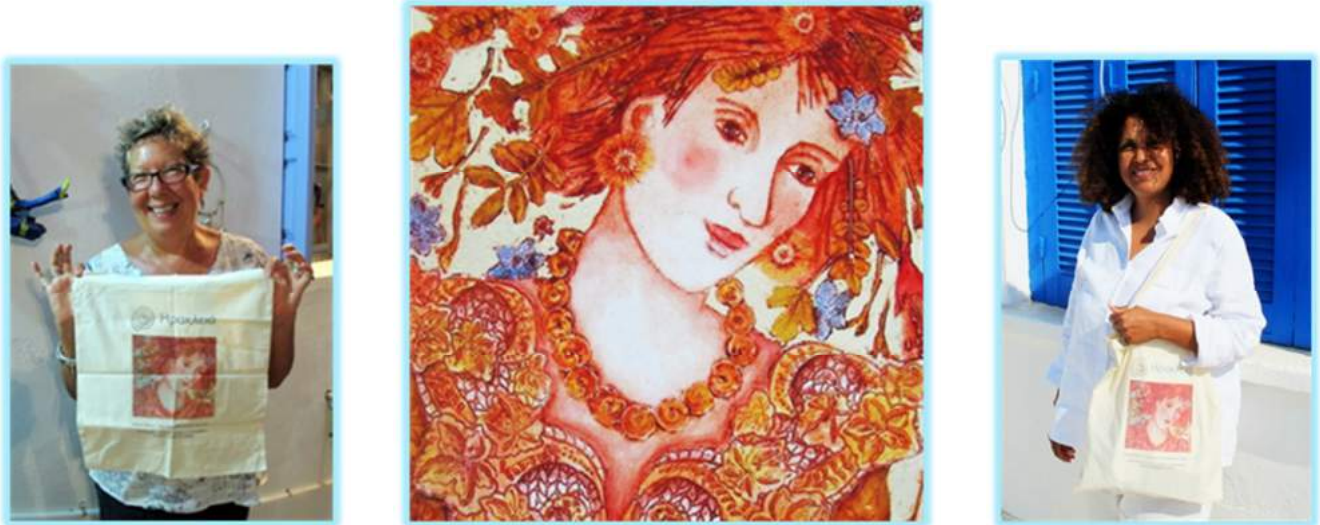
Iraklian goddess by